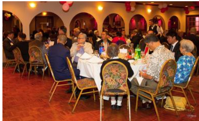
A view of the luncheon participants.

Western Hemisphere strategy and the Coast Guard's effort to curb illicit smuggling of the contraband. He entertained several questions about the Arctic and Coast Guard's recapitalization effort to rebuild its icebreaker fleet."