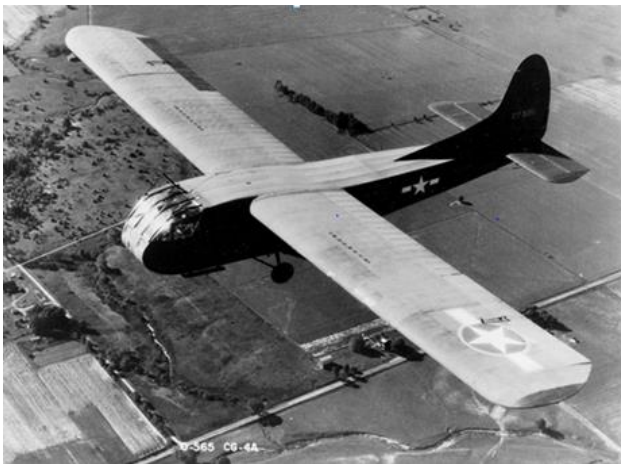
The CG-4A "WACO" glider was the type used by 442 nd Anti Tank Company in the southern France invasion.