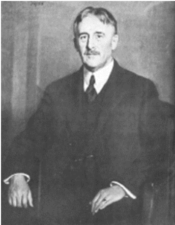
Henry Lewis Stimson

Secretary Stimson said the dropping of the atomic bombs on Hiroshima (August 6, 1945) and on Nagasaki (August 9, 1945) remains the most controversial in modern history. Historians have actively debated whether the bombings were necessary, what effect they had in bringing the war in the Pacific to an expeditious end, and what other options were available to the US. Stimson authored an article, "The Decision to Use the Atomic Bomb" printed in Harpers Magazine in February 1947. Harpers gave permission to any newspaper to print without charge this article because of "its exceptional public importance."