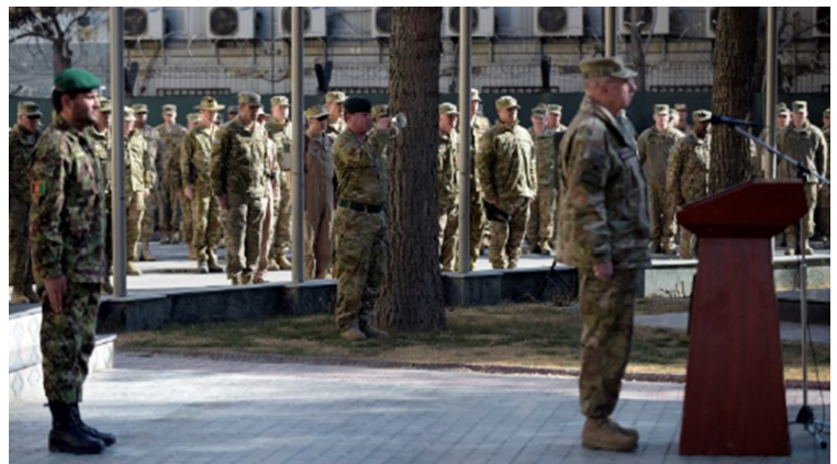
Weekly Memorial Service at Resolute Support (RS) Headquarters

November 11, which marks the end of WW I, is recognized in the United Kingdom, Europe, and America. Give thanks to the veterans and to the men and women on active duty to protect our freedom.