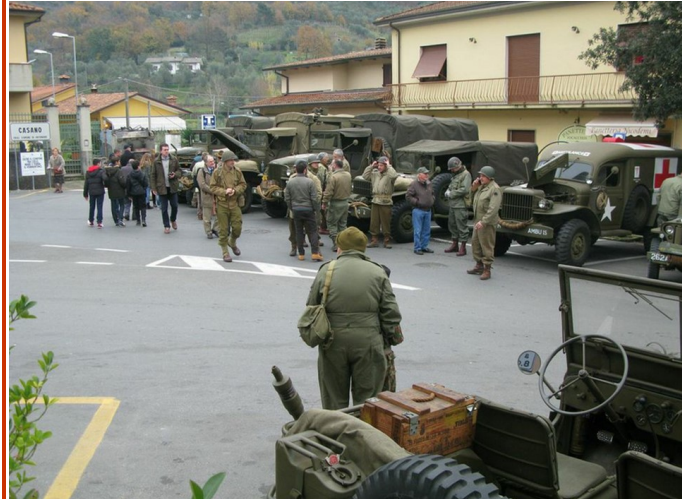
Reenactors staging to participate in the event.