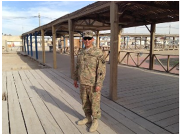
Empty boardwalk at Kandahar, November 2014