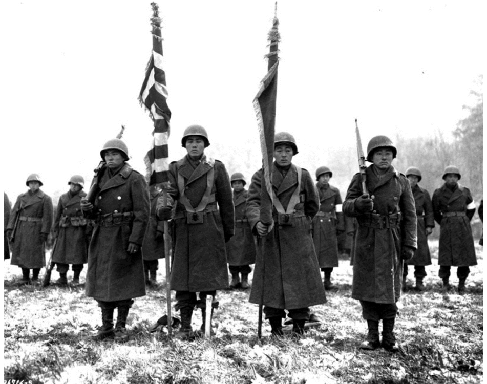
Two color guards and color bearers of the Japanese-American 442d Combat Team, stand at attention, on Nov. 12, 1944, while their citations are read. They are standing on ground in the Bruyeres area, France, where many of their comrades fell.

© 2015 The Honolulu Star-Advertiser Visit The Honolulu Star-Advertiser at www.staradvertiser.com Distributed by Tribune Content Agency, LLC