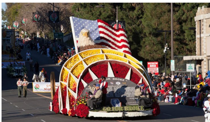
The Go For Broke float was at the front of the line as it followed presenting sponsor American Honda Motor Company and sponsor Wells Fargo Bank.

The Go For Broke float, a part of the City of Alhambra's entry in the 2015 Rose Parade, honored the Japanese American veterans of World War II. GoForBroke National Education Center's Torch for January 2015 said "There are so many wonderful memories – from the construction of the float, to the scores of volunteers who painstakingly glued seeds and flowers to the float, to the excitement of judging day, to the drive down Colorado Boulevard!"