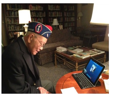
Shima, in Maryland, viewing screen with photo of two students in Singapore.

assure a richer experience and engagement by everyone.